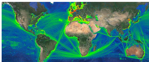
Figure 1: Worldwide AIS positions acquired by satellites (ORBComm)

The maritime environment has a huge impact on the global economy and our everyday lives. Specifically, Maritime Situation Awareness (MSA) and surveillance systems have been attracting increasing attention due to their importance for the safety and efficiency of maritime operations. Safety and security are constant concerns of maritime navigation, especially when considering the continuous growth of maritime traffic around the world and persistent decrease of crews on-board. For instance, preventing ship accidents by monitoring vessel activity represents substantial savings in financial cost for shipping companies (e.g., oil spill cleanup) and averts irrevocable damages to maritime ecosystems (e.g., fishery closure). This has favoured and led to the development of automated monitoring systems, such as the Automatic Information Systems (AIS) and institutional initiatives for maritime data infrastructures [31]. However, the necessary correlated exploitation of large data sources offering historical and streaming maritime data is still a crucial computational issue. For instance, a typical volume of radio and satellite-based worldwide maritime data represents an estimated 18 millions positions per day [16] (see Figure 1 for an illustration of AIS coverage at the global level).